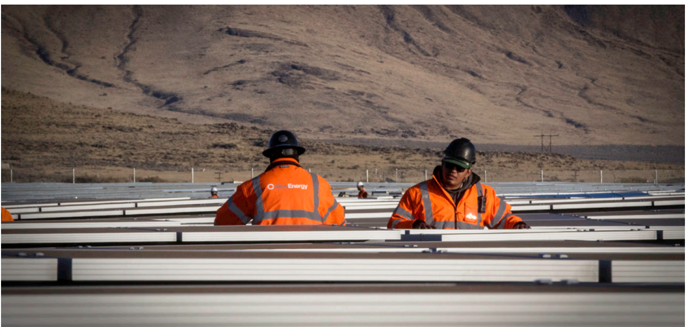
Bifacial Reflective Foundation Reduces Overhead Lift Demands