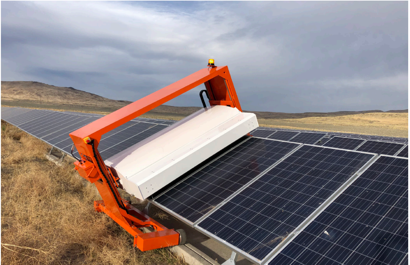
Spot dry and wet robot

insurance tool to know you will meet your debt service coverage ratio on a low priced PPA. Low PPA prices equate to a lower tolerance for energy losses. Affordably increasing cleaning frequency minimizes these losses.