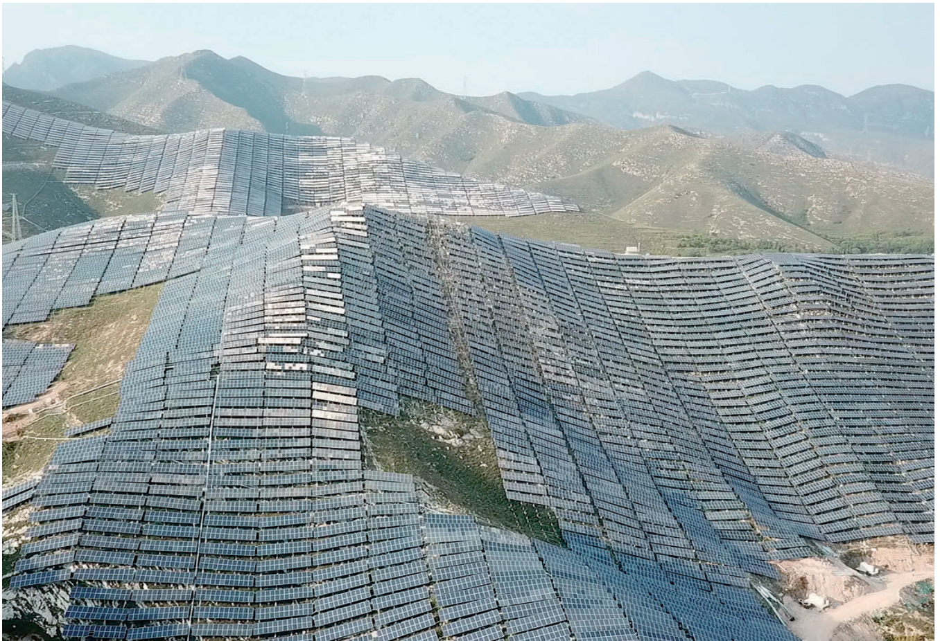
Different module orientations require extra POA pyranometers

‘By comparing the opportunity cost of lost energy production with the cost of cleaning the O&M staff can decide when, and where, to clean modules on a site-specific basis.’