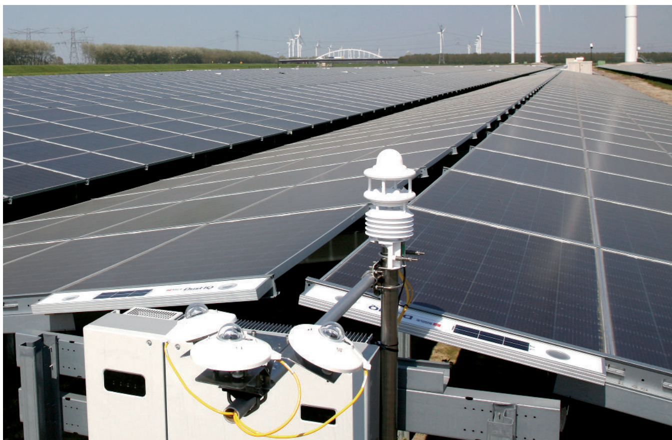
Class A monitoring system: GHI and POA pyranometers, weather station, soiling monitors