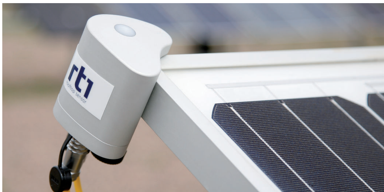
Class C irradiance sensor with compliant module temperature sensor

This type of monitoring system is largely intended for commercial rooftop installations to give an idea of the PV installation efficiency where there are no significant performance-related financial and contractual implications.