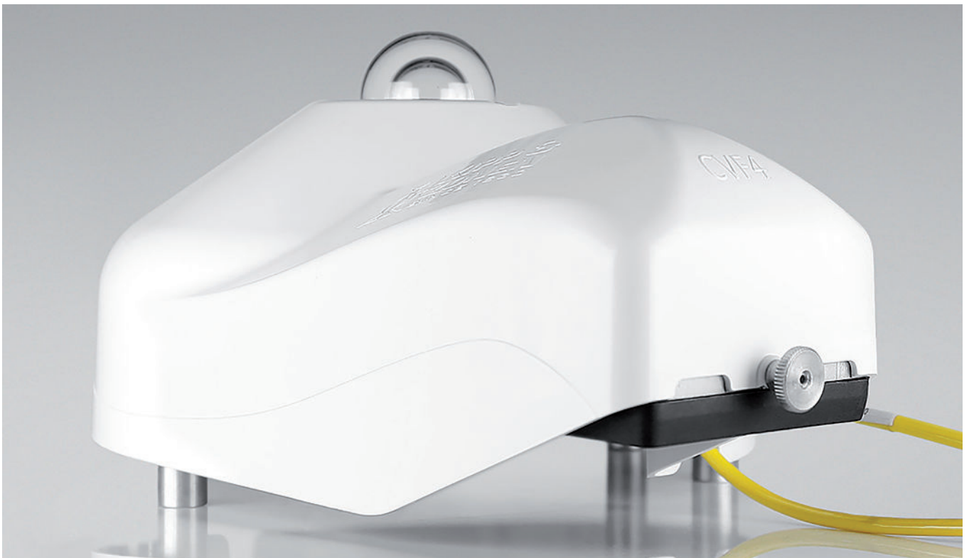
Pyranometer with ventilation and heating unit

utility-scale PV plants often have significant contractual under-performance penalties. The uncertainty of the hourly irradiance totals will be around 6-8% and this is not good enough for meaningful PR calculations that will satisfy all stakeholders. It is unlikely that stakeholders will see a necessity to install 6 module temperature sensors per monitoring system.