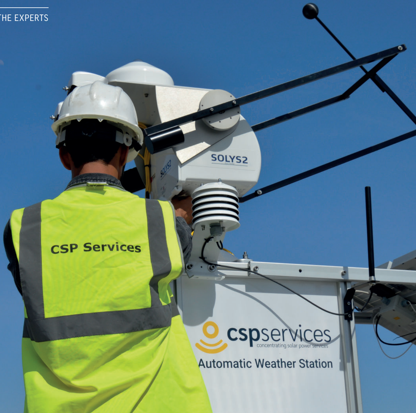
Customized automatic weather station