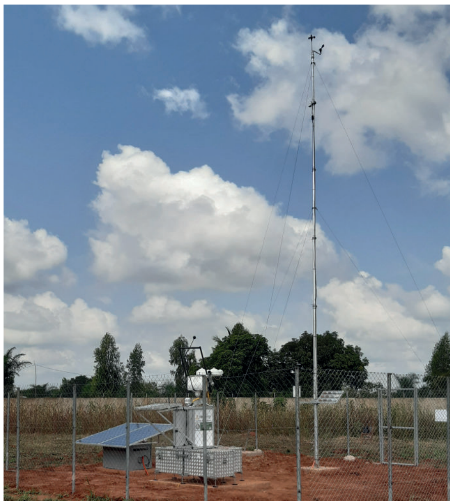
Solar resource project in West Africa

For me, this is hard to understand. Solar radiation is the resource of solar power