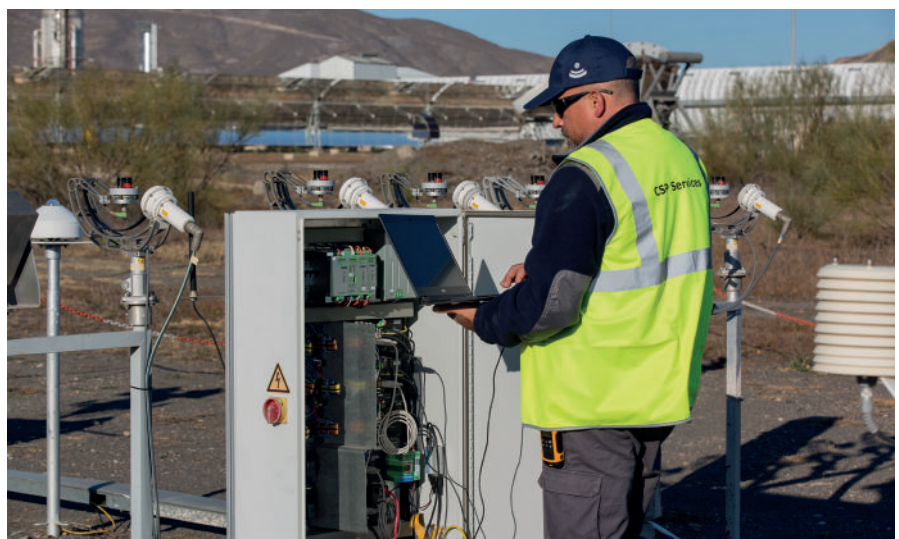
Operation and maintenance of automatic weather stations