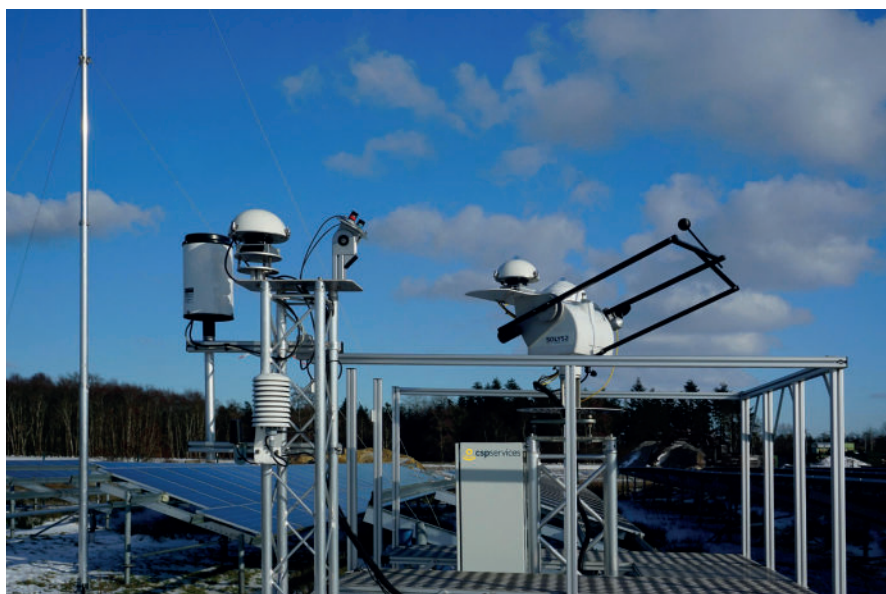
Automatic weather station with integrated cloud camera for nowcasting

RA: It's not one or the other. The magic is in the right mix. Satellite data is used to calculate long-term average values due to its long-time availability; ground data is much more precise and has a much higher time resolution.