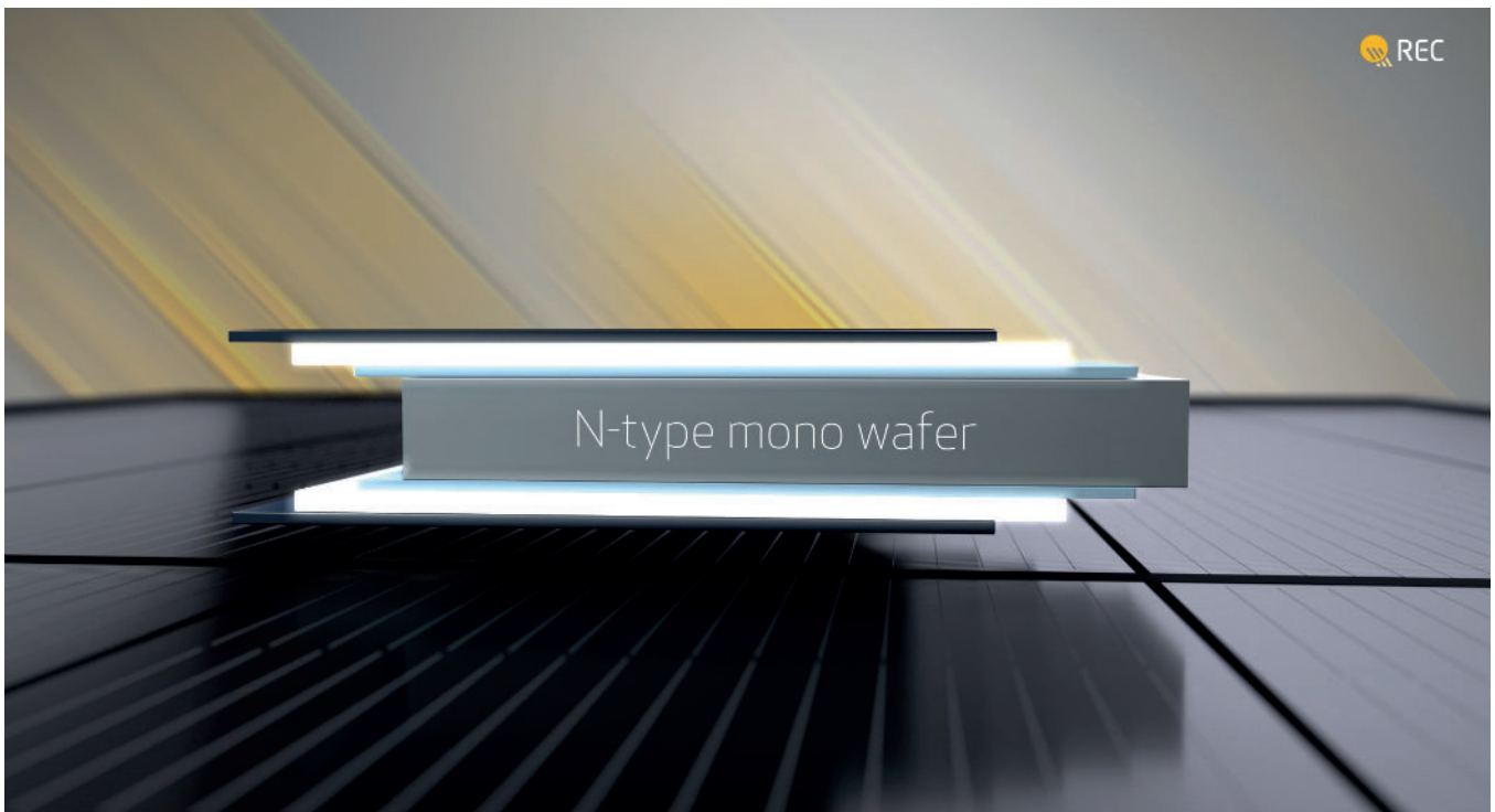
The high-power density REC Alpha Pure solar panel is based on HJT, one of the most advanced cell technologies

PES: 500 GW per year. Does this mean that we need the highest power output solar panels possible?