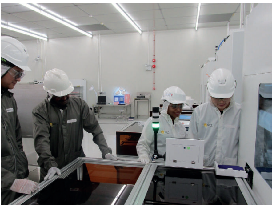
REC Alpha cell production in Singapore

Another aspect: When sawing wafers from silicon blocks, 30% of the silicon is waste.