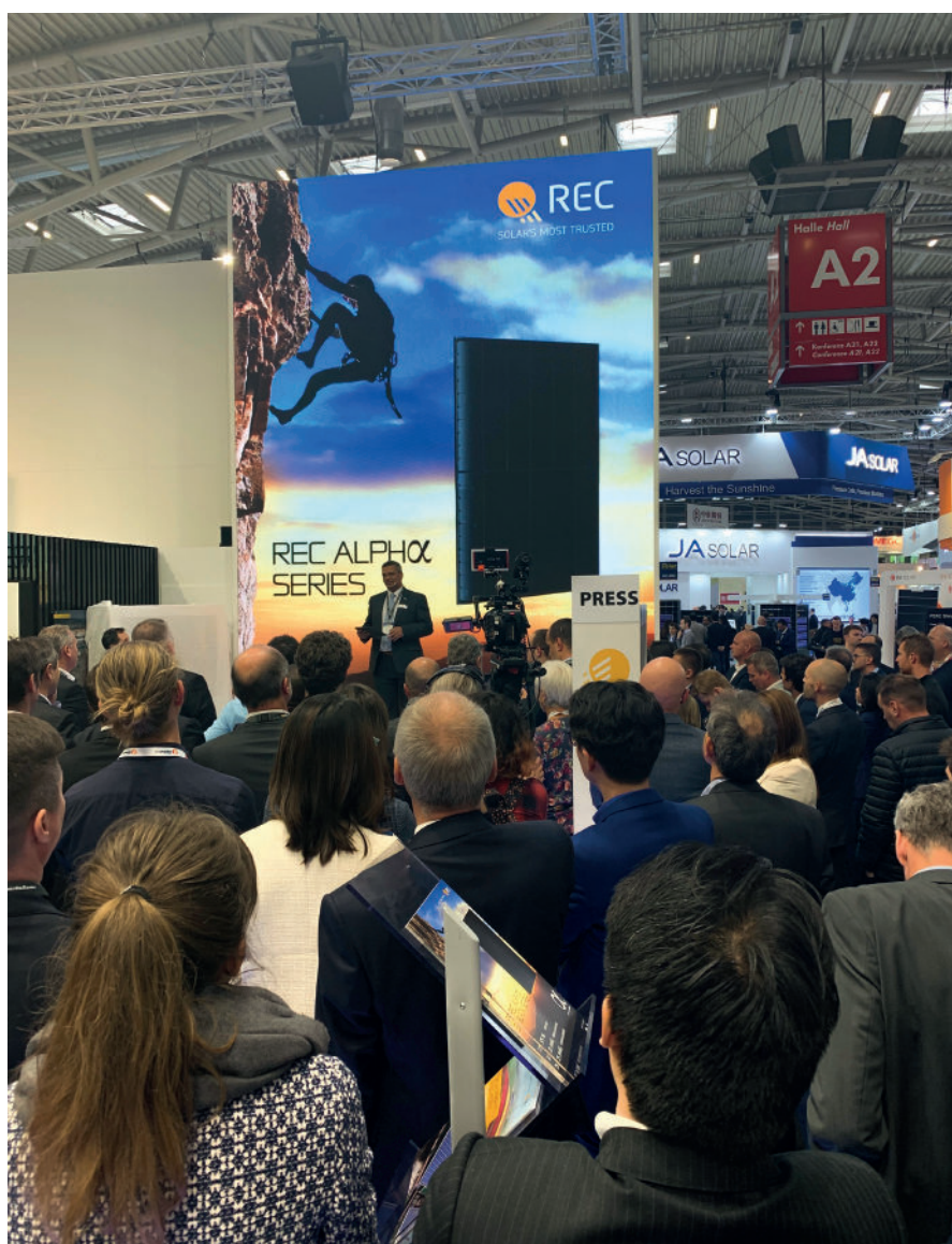
REC Alpha Series launch at Intersolar Europe 2019

and disassembling scrapped modules into their components, also for recycling. This again saves resources.