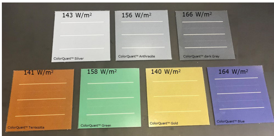
Examples of one cell solar modules with colors achievable by ColorQuant™. Uncolored reference module had 175 W/m²

on a white background. As a solar cell is always very dark, at least if the efficiency is high, we work with a RGB system like the human eye. This is shown in graph 1.