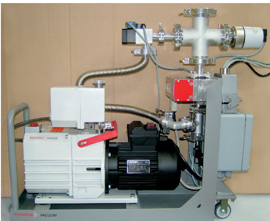
Fig. 1 Customized pumping cart for solar receiver degassing

Several methods, according to internationally accepted regulations, can be used with the tracer gas and the detector technology based on mass spectrometry. This leads to unrivaled sensitivity and selectivity going along with easy calibration and high repeatability and reproducibility of the test.