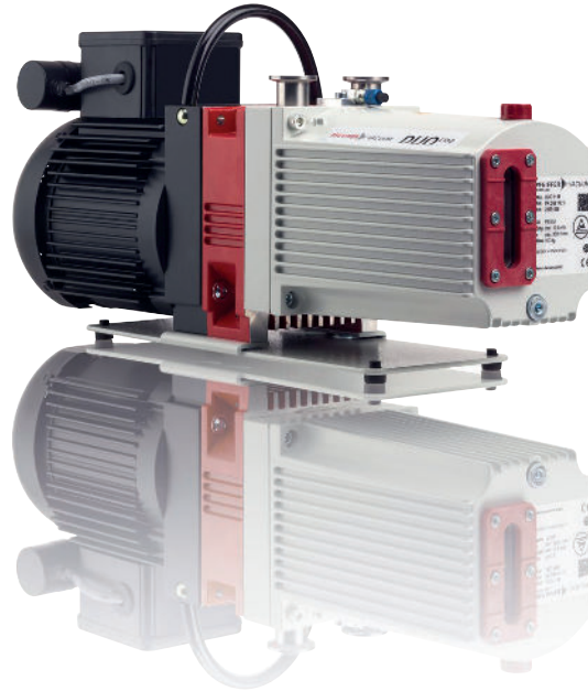
Rotary vane pump DuoLine

filling chamber with a defined helium concentration is created, using an adaptation at the pipe ends.