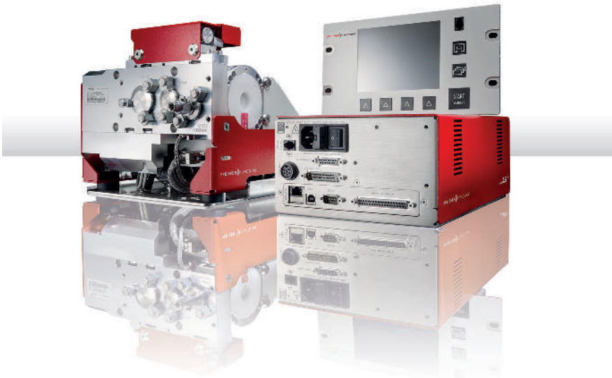
Leak Detector ASI 35

transfer medium, heat is lost not as a result of convection but by radiation that transports considerably less heat than convection. Physically, a vacuum of below 10^{-3} mbar offers optimal heat insulation. As a result, the specified pressure must be maintained during the entire service life of the receiver. In addition, the gas supply caused by the permeation of sealing materials, desorption from the walls or leaks must be minimized.