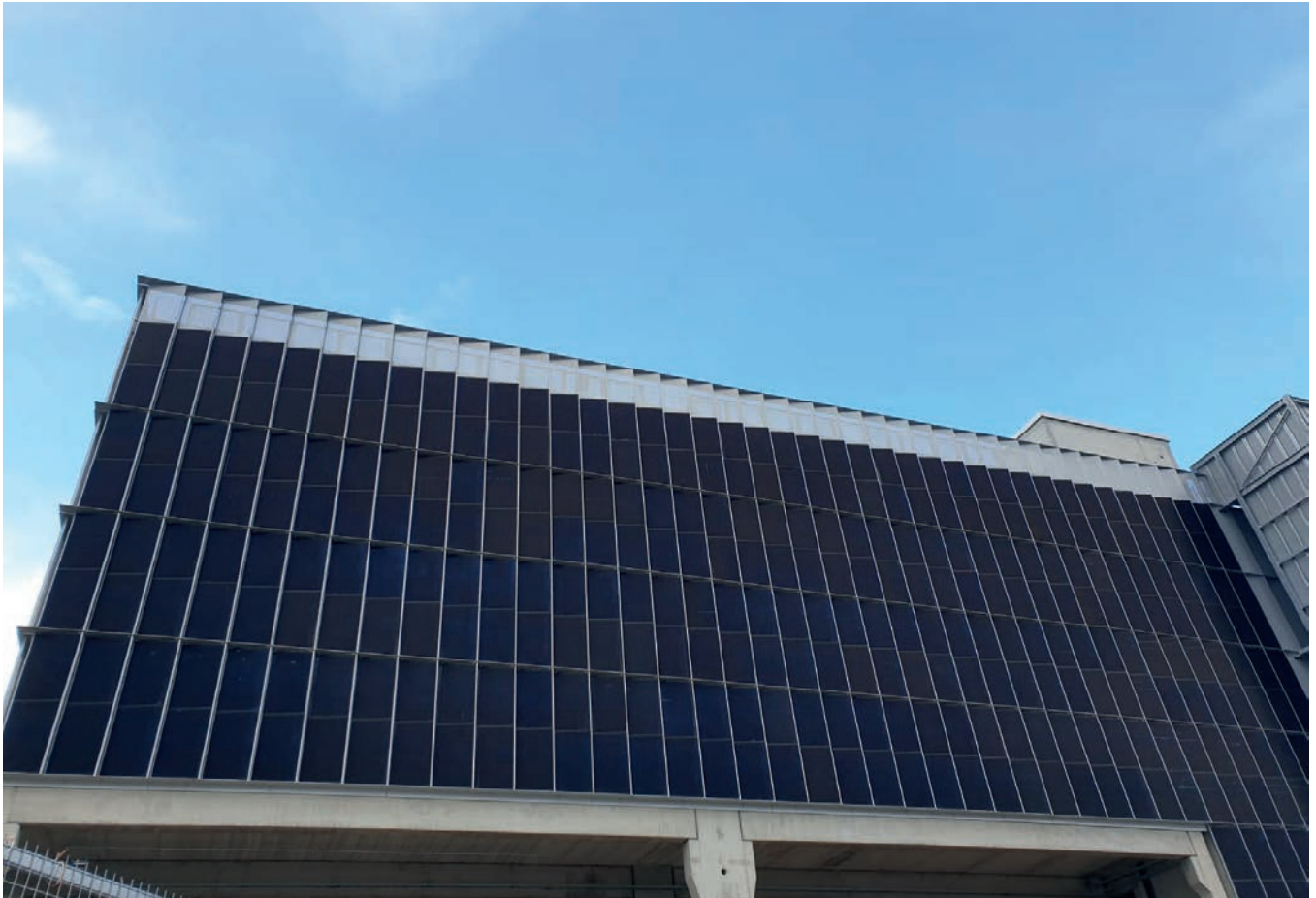
PV walls of a parking garage at the Helsinki-Vantaa Airport

technologies, Valoe can offer its customers the entire production chain from the invention to a finished industrial PV product.