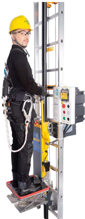
Climb Auto System by 3S Lift

there can be considerable financial benefits.