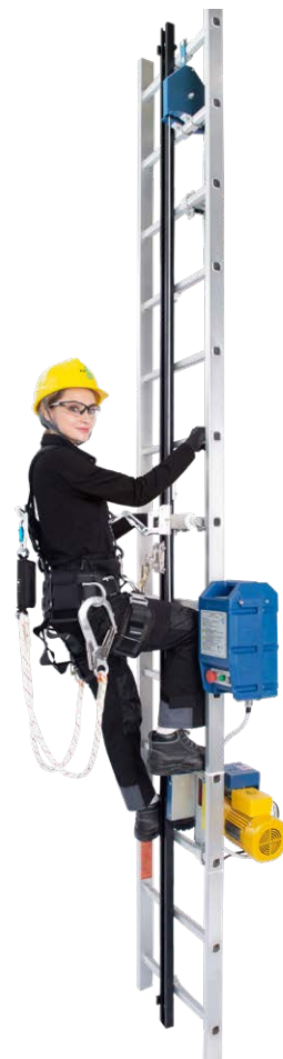
Climb Assist by 3S Lift