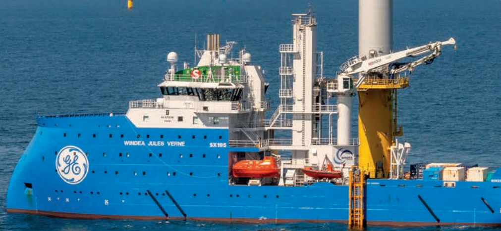
Windea Jules Verne at OWF Merkur