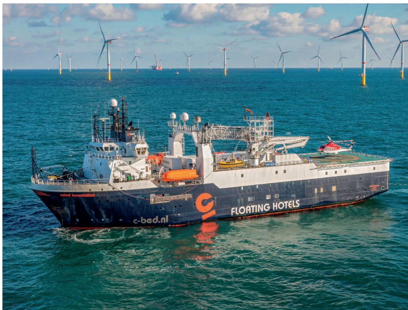
Wind Innovation Heli crew-x

services on time, within budget and at competitive cost that fully meet the applicable requirements. Maintenance and improvement of the DHSS Management System, which is designed to the standards and principles for Quality Management, Health & Safety Management, and Environmental Management is a continuous process.