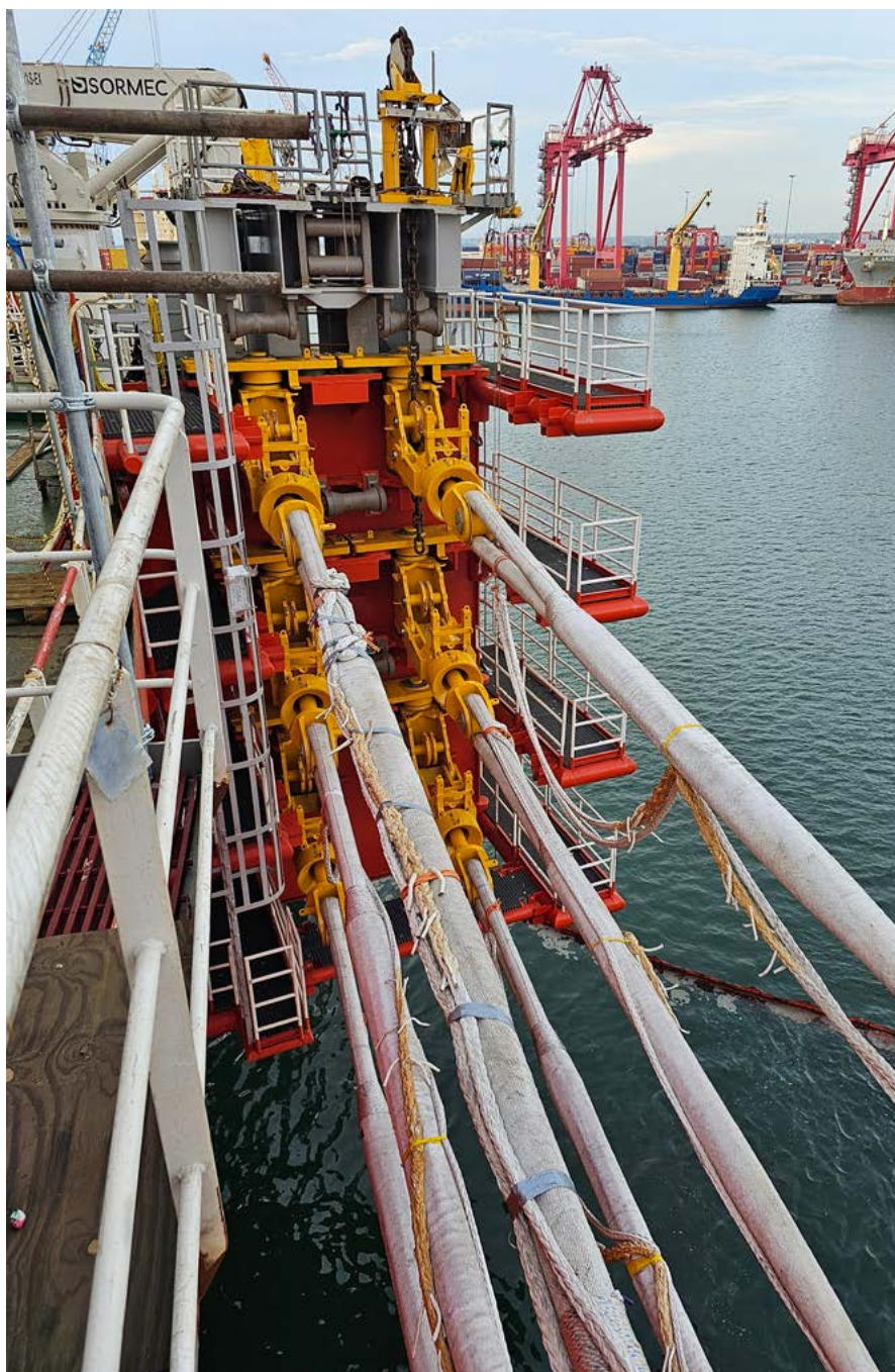
BarMoor™ Quick Connectors with Moveable Chain Jack Installation

Mooring decisions should not be left until after other decisions are made. They