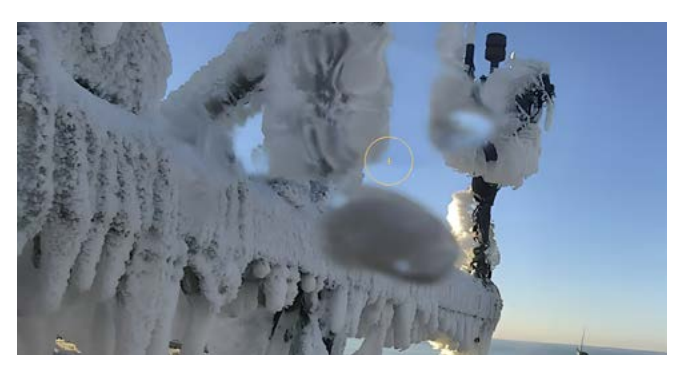
A nacelle surface without NEINICE coating covered in a thick layer of ice These photos were taken on the same day