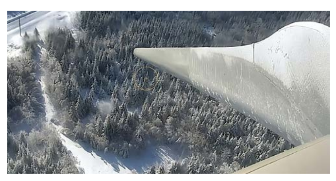
A blade from the same turbine which is free of ice build-up

would be at 0%. At wind farm #2 the percentage increase was 40% for year 1, 29% for year 2 and 12% for year 3, with the assumption that year 4 would be at 0%. That customer is going to be doing a 4 year recoat program because the winter production more than pays for the maintenance program.