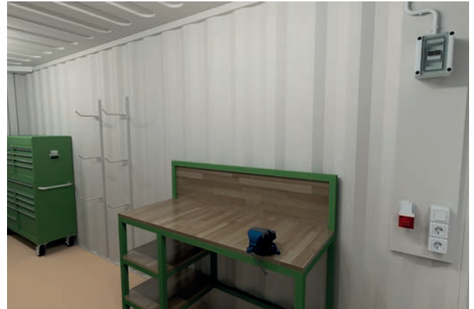
ELA Offshore Workshop Container with workstation