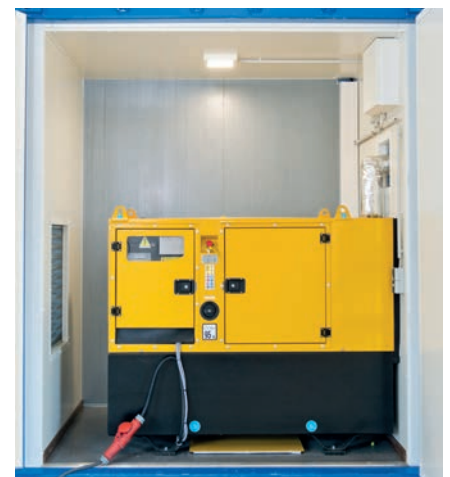
Generator in an autonomous container