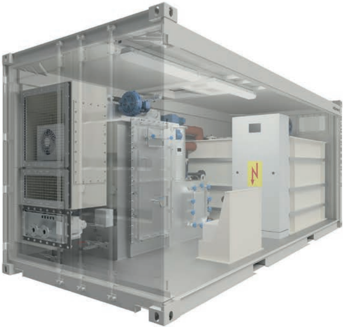
ELA Wastewater Treatment System