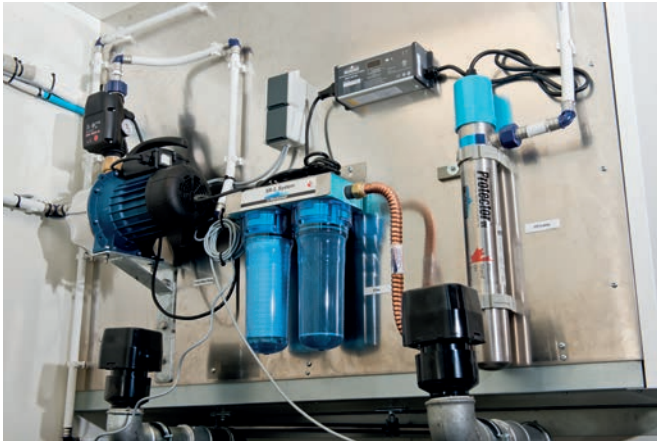
Filter system and UV lamp in an autonomous container