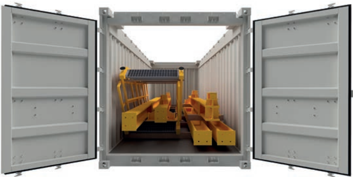
ELA Offshore Open Top Container loaded