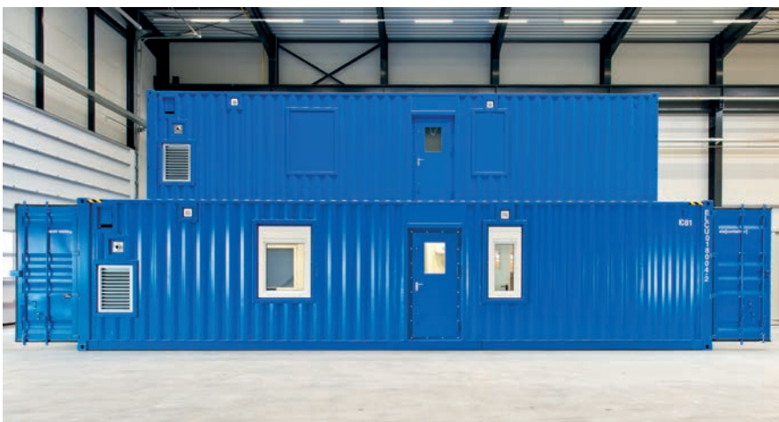
40ft autonomous container