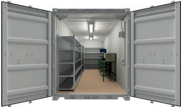
ELA Offshore Workshop Container with workstation