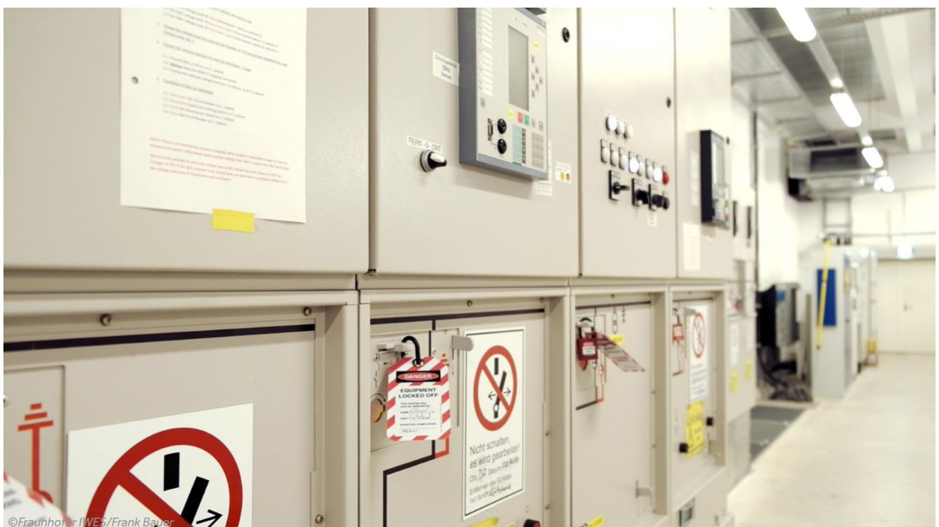
40 kV medium-voltage switchgear units

The course of the voltages coincides to within a few per cent in the pre-fault case, with the series impedance switched on, and in the fault case. The standard-conforming evaluation shows that the results are within the tolerance bands even when considering the dynamic behavior. Furthermore,