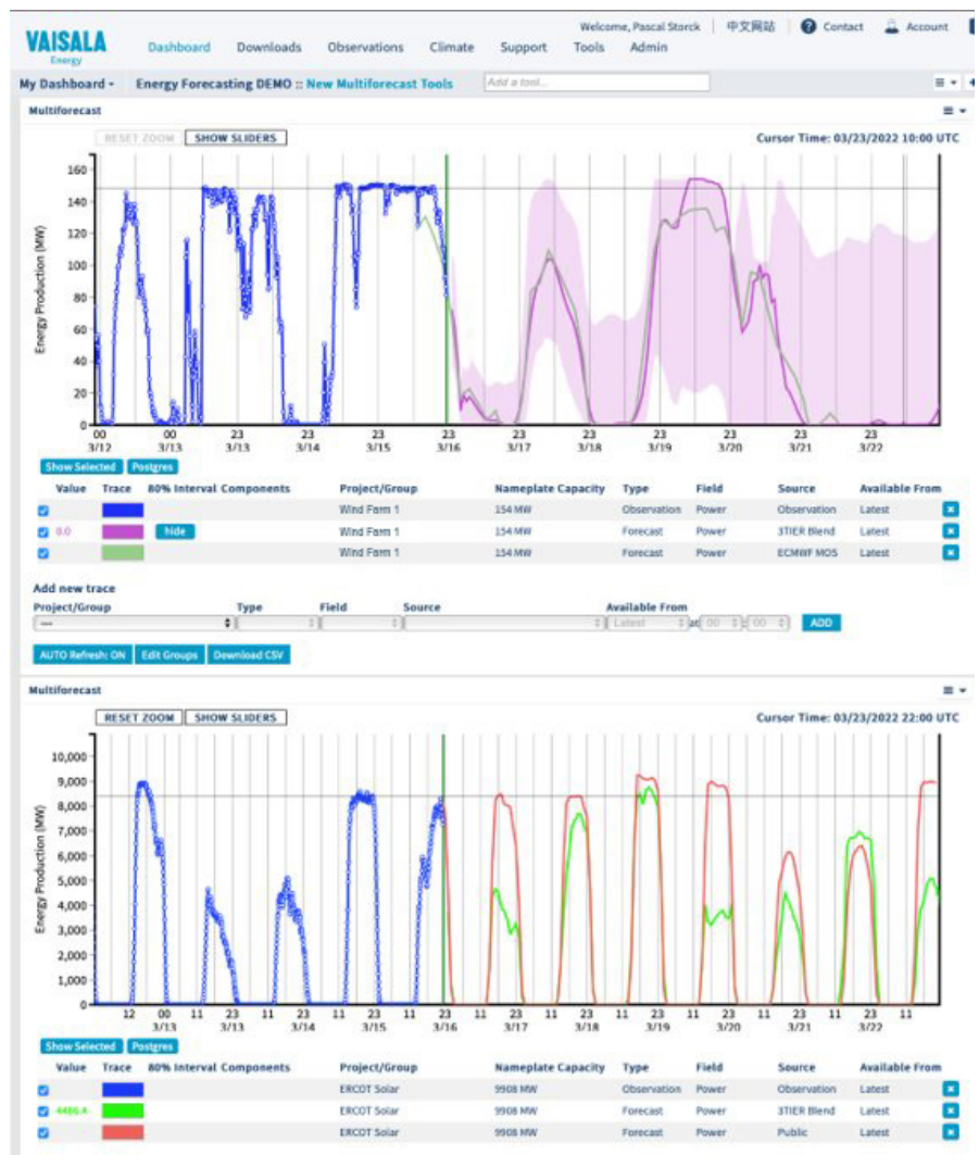
Ex: Solar forecasting

Whether used in onshore complex terrain or remote offshore locations, WindCube