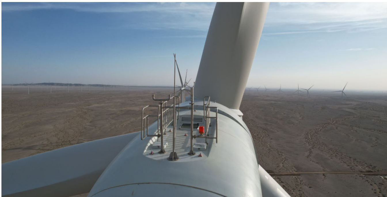
Wind sensors measure a variety of weather conditions

suited for troubleshooting and identifying underperformance.