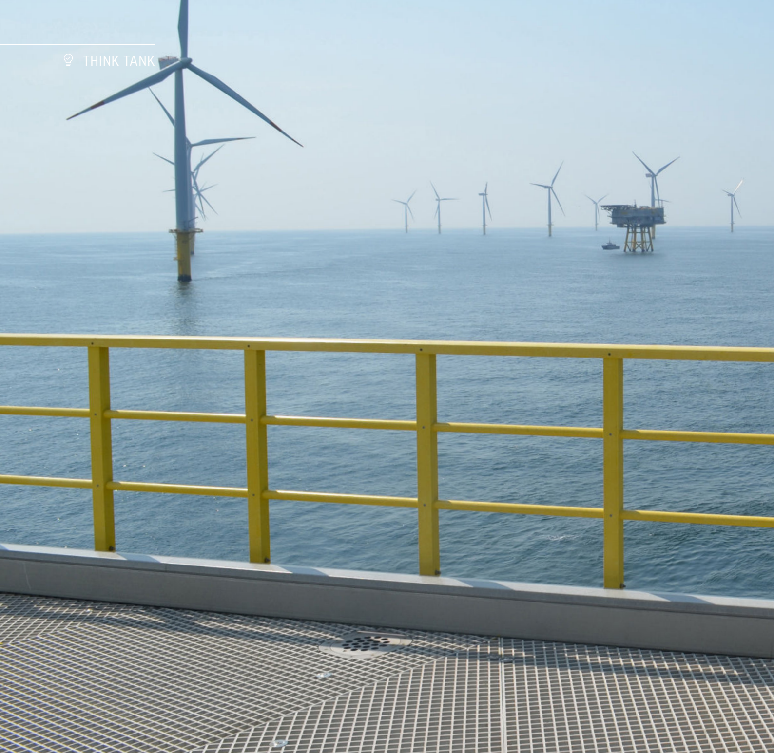
WindCube Scan lidar for offshore wind measurement