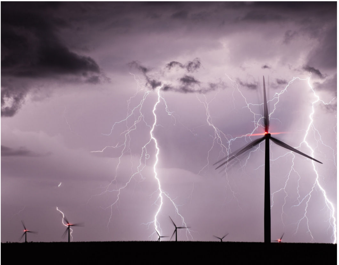
Lightning data provides critical information to protect assets and people

and the influx in the demand for solar, the growing renewable energy industry will need comprehensive solutions that address every stage of the life cycle to expand and open the door to a healthier, greener, more innovative future, and create lasting societal change.