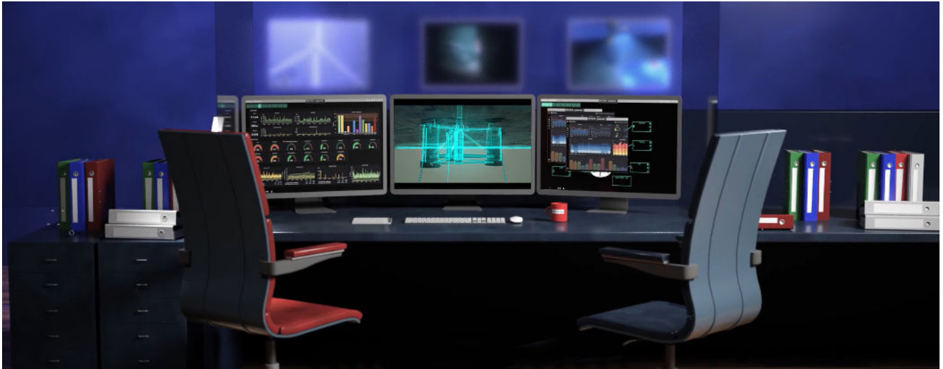
Desktop performance insight

The information helped to validate the foundation's dynamic model and provided other important lessons applicable to commercial-scale floating offshore wind projects. INTEGRipod sensors are retrievable by remotely operated vehicles (ROV) and use magnetic holders for ease of installation and removal. Pulse provided and installed three INTEGRipod units at each of the seven measurement points on the TetraSpar demonstrator.