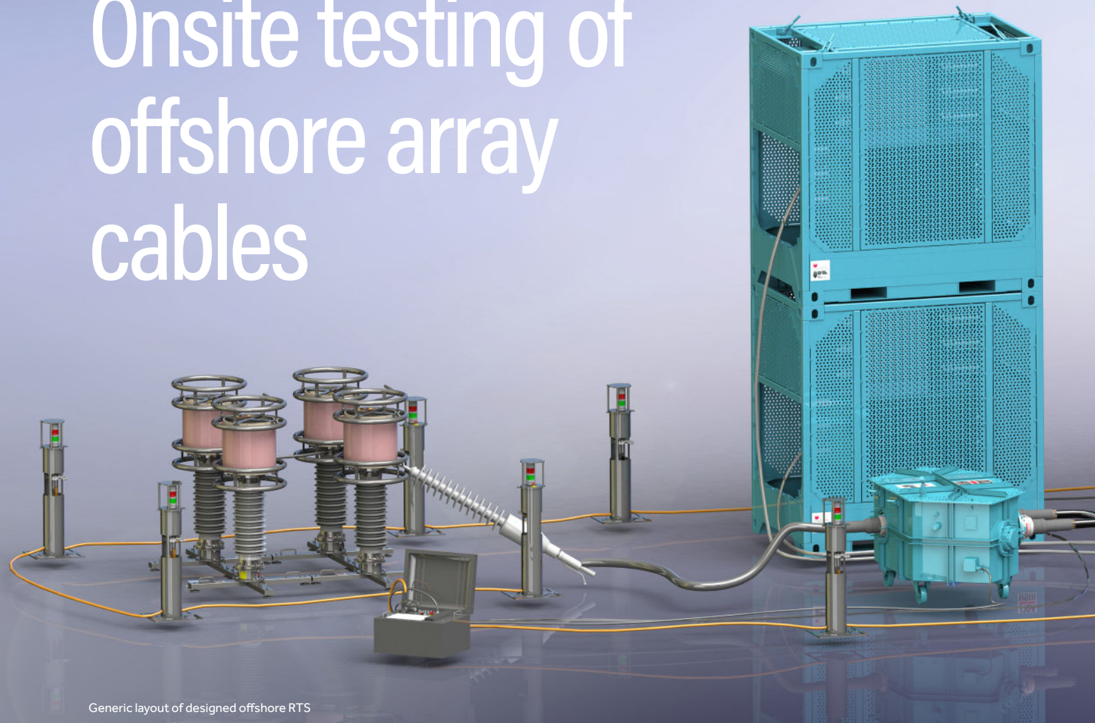
Generic layout of designed offshore RTS

The design, installation and commissioning of offshore wind farms are facing several challenges for the inter array grid. The continuously increasing power ratings of the individual wind turbines leads to increasing operating voltages ( U_m ), from 36 kV to 72.5 kV for the inter array cables to reduce operating currents and therefore thermal losses. As these cables are designed as high voltage and not as medium voltage cables, the after-installation testing should be done by resonant test systems (RTS) as defined in IEC 63026:2019 and CIGRE TB 841.