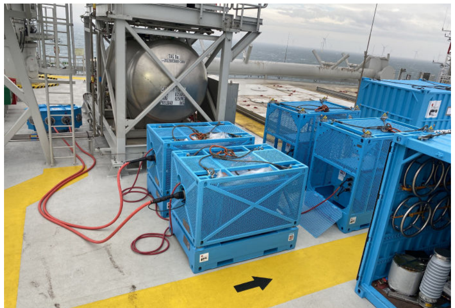
Setup of RTS at OSS