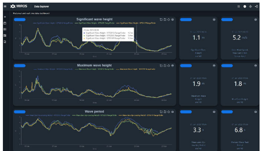
Miros Data Explorer is a data analytics service for data streaming from IoT devices. Interactively explore and build purpose-oriented all-in-one sharable dashboards to preview and analyze real-time and historical data from one or multiple sensors across the sites

Key to the success of this process is sorting correctly recorded data and harnessing this to provide valuable insights. Earlier this year, the company launched Data Explorer,