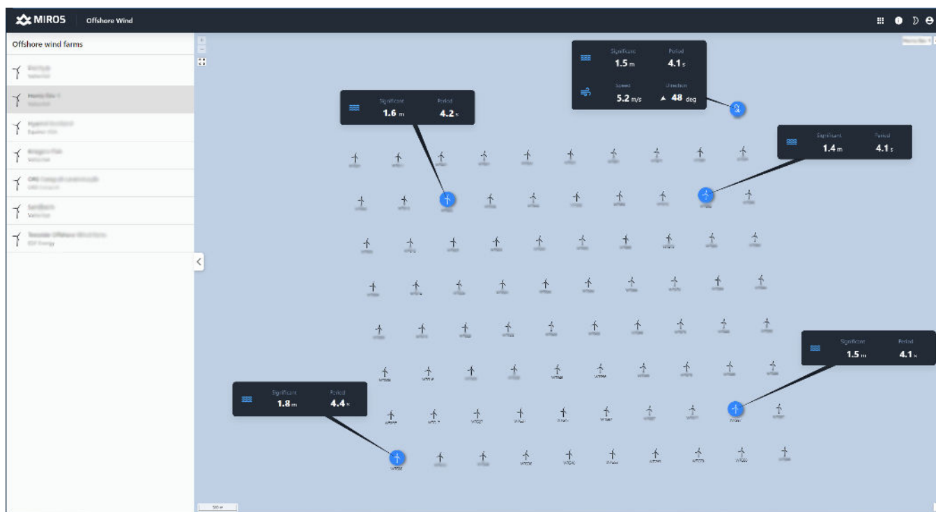
Miros Offshore Wind portal to improve visibility of wave conditions at each turbine or substation location for improved operational planning and infield decision-making

another new solution allowing real-time and historical data from one or across multiple offshore wind sites to be monitored using easily created purpose-oriented, all-in-one shareable dashboards.