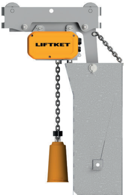
LIFTKET Service Crane Solution

Within the LIFTKADEMIE we aim to provide our customers and their employees with the necessary know-how to ensure safe working on and with our electric chain hoists. On the one hand, 3 'standard trainings' can be booked: Repair & Maintenance, this training can also be booked online via our website www.liftket.de , Train the Trainer and Sales Training.