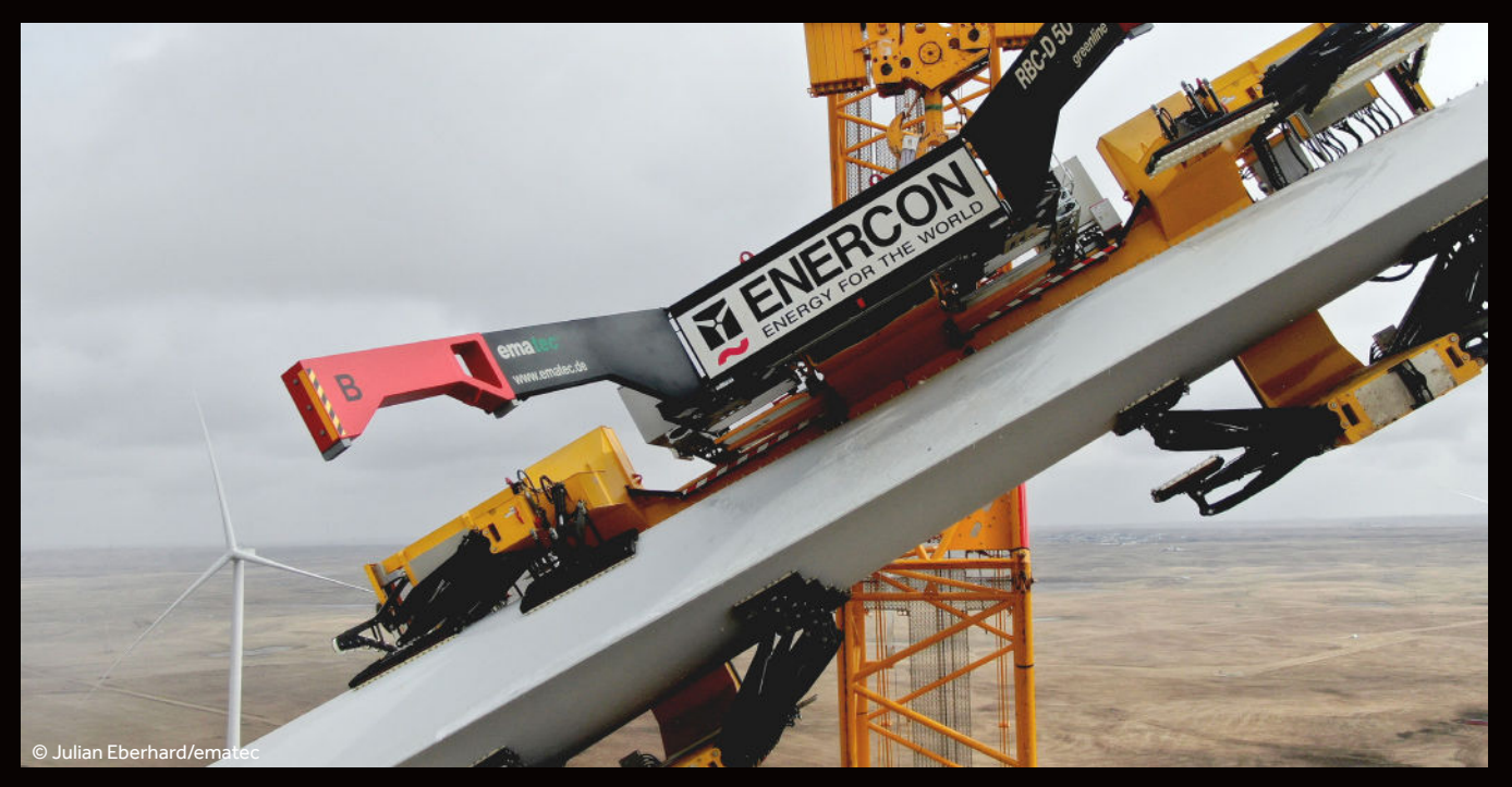
The RBC-D50 yoke from ematec is in use worldwide