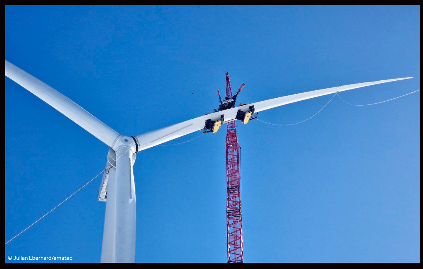
The RBC-D50 rotor blade clamp from ematec in Canada

installation, making installation much more space-efficient.