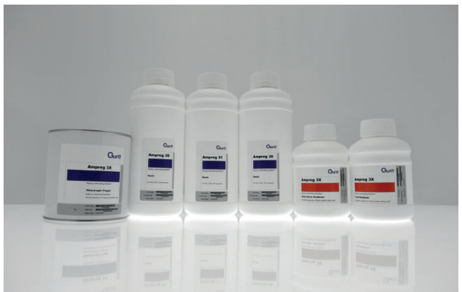
Gurit's Ampreg 3X low toxicity laminating system includes a range of resins and hardeners for different repair conditions

Gurit has a range of OEM-qualified and certified, low toxicity epoxy materials for all