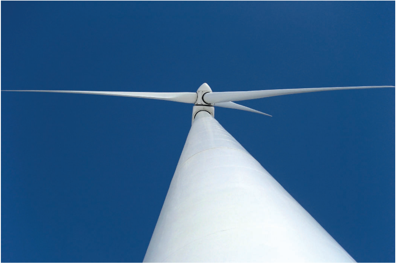
Gurit's blade repair systems are OEM and DNV-GL qualified and available from the company's numerous sites around the world

target viscosity, drainage resistance, and fabric impregnation, all of which can be combined with the common range of Ampreg 3X slow, standard or fast hardeners. The award-winning system has built-in UV stability for emergency repairs which don't have the time for a topcoat and is suitable for extreme weather conditions (including 5-10°C and high humidity).