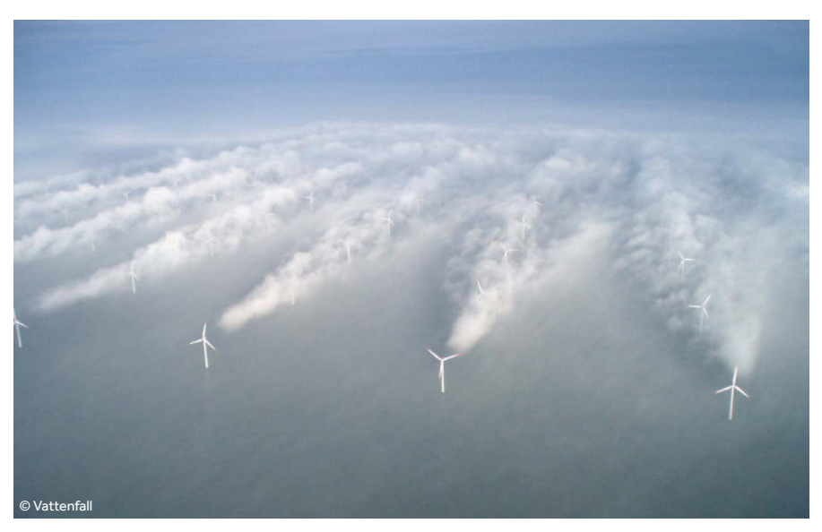
Horns Rev 1: Innovative technology to understand the health status of the last generation turbines, and to know when to administer preventative or protective measures, is the cornerstone of reducing the operational cost

To encourage further cost reduction and safety onsite, Miros typically offers remote start-up configuration and client training as well as all maintenance, software upgrades,