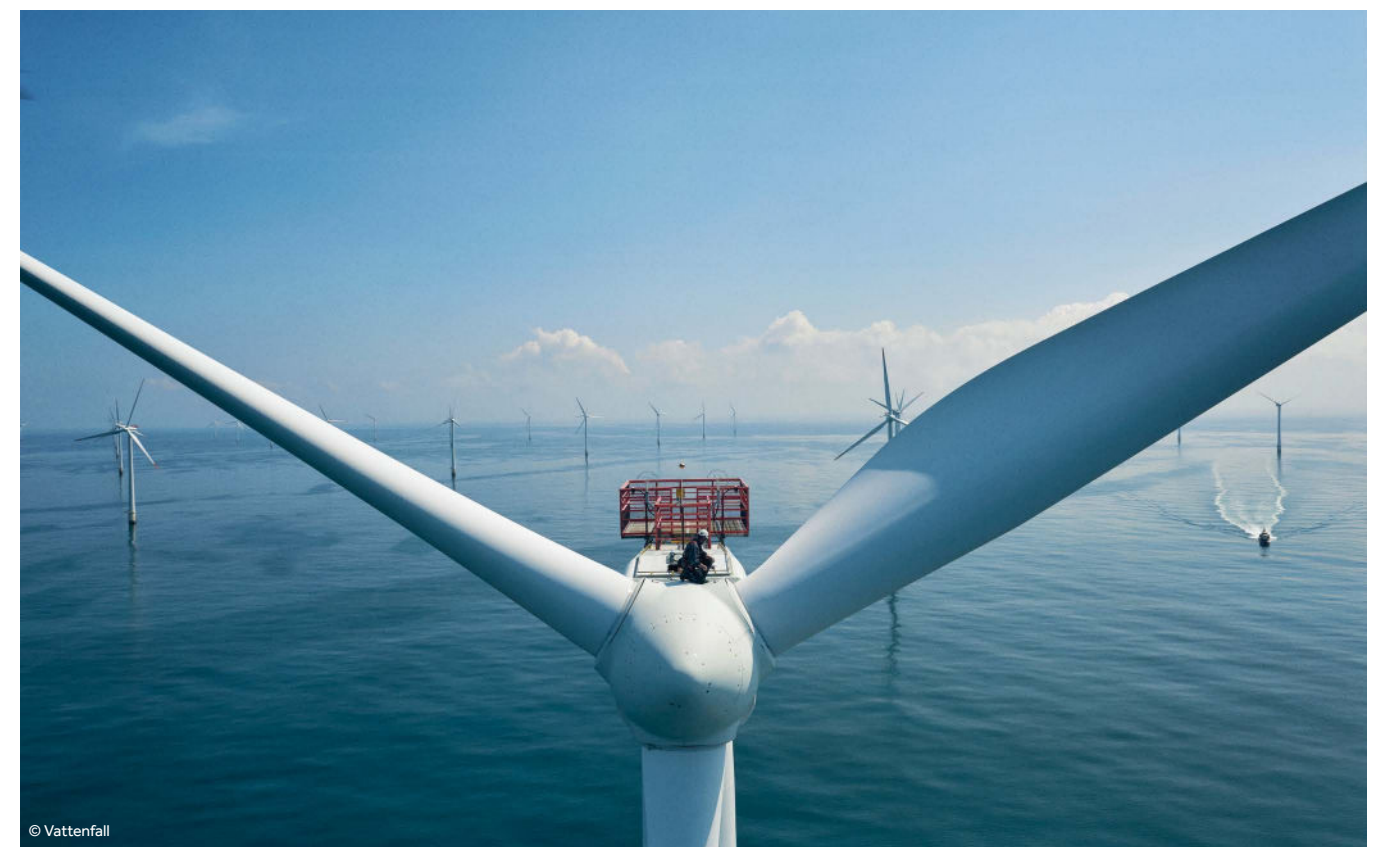
Horns Rev 1: Keeping the turbines turbines turbines remains the biggest opportunity to tackle climate change. Securing significant improvement in this vital area is viewed as the most important lever for the energy transition

Since the 1950s, wave buoys have been the go-to technology to analyse the frequency, behaviour, and direction of waves in oceans across the world. However, as a single point of measurement on a wind farm site covering multiple square kilometres, their accuracy